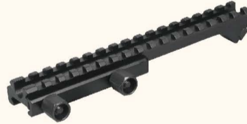
1/2" Extended Low Profile Rise Mount With QD K knobs