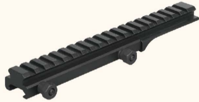
5/8" Low Profile Extended Riser Mount With QD K knobs